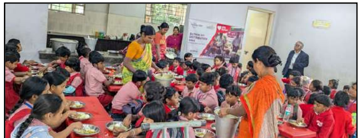
Mid-Day meal served at Rotary Vivekananda School

The initiative was further strengthened through collaboration with Keventer Agro Limited , which contributed 1,320 juice pouches , adding an additional refreshment component to the distribution drive and expanding the overall reach of the program.