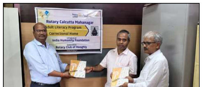
Bishnupur Subsidiary Correctional Home