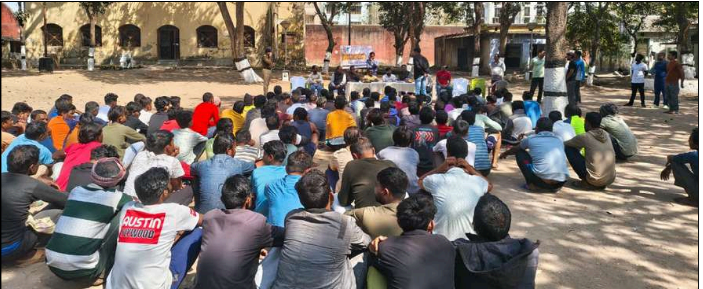
Adult literacy orientation in a correctional home of West Bengal

Education has the power to change lives—even in places where opportunity feels limited. Through its Adult Literacy Program , India Humanity Foundation with the support of Rotary Calcutta Mahanagar is bringing learning into correctional homes across West Bengal, creating pathways for personal growth, confidence, and rehabilitation among inmates. A key strength of the program is its peer-learning approach , where educated inmates are trained as Inmate Teachers to guide fellow inmates through structured literacy sessions.