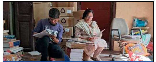
School teachers at IHF book collection centre

These libraries have been designed as safe and engaging spaces where children can develop reading habits, explore new ideas, and build a stronger connection with learning. To support this initiative, a total of 5,507 books has been distributed among students and community learning centres. The collection includes academic support books, general knowledge titles, and storybooks that encourage curiosity and imagination among young readers.