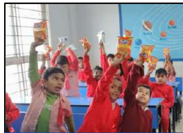
Happy students of Rotary Vivekananda School

Daily Mid-Day Meals at Rotary Vivekananda School: 600 children