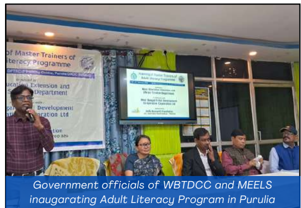
Government officials of WBTDCC and MEELS inaugurating Adult Literacy Program in Purulia