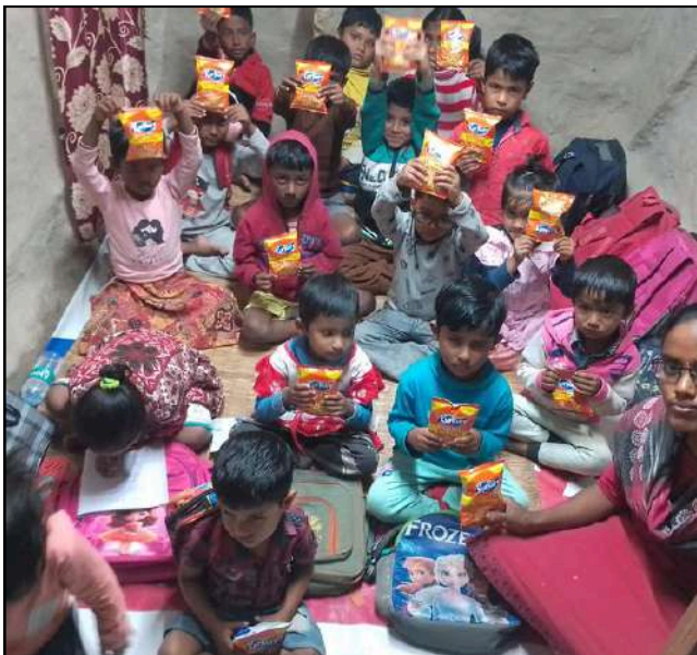
Happy children of Sitarampur Vivekananda Seva Pratishthan