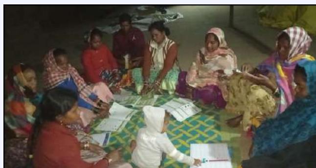
Adult learners at a literacy centre