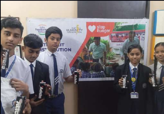
Students of St. Stephen's School

Food support initiatives by IHF continue to assist vulnerable families and children across West Bengal