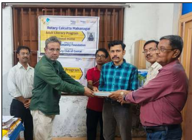
Contai Correctional Home

To keep the program moving forward, books and learning materials have already been delivered to several correctional homes where new orientation sessions are planned. These include Bankura District Correctional Home, Bishnupur Sub Correctional Home, Jangipur Sub Correctional Home, Kandi Sub Correctional Home, Lalbagh Sub Correctional Home, Bolpur Sub Correctional Home, Durgapur Sub Correctional Home, Suri District Correctional Home, Asansol District Correctional Home, Chanchal Special Correctional Home, and Durgapur Open Correctional Home.