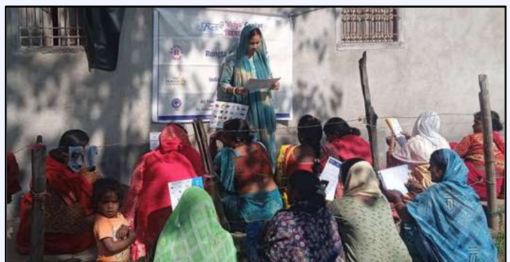
Adult literacy centre in Jharkhand