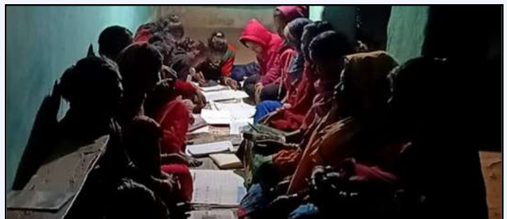
Night classes at vidya centre

Across 42 literacy centres , the program is currently reaching 1,680 adult learners in Chatra district (Jharkhand) and Nuapada district (Odisha) . Regular monitoring ensures that learning remains consistent and meaningful.