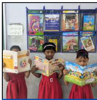
School students reading books donated by IHF

This progress from Kolkata reflects the broader vision of the Padho Bharat initiative, to make books accessible to every child and promote a culture of reading across communities . Through continued collaboration and community engagement, IHF remains committed to expanding learning opportunities and empowering young minds across India.