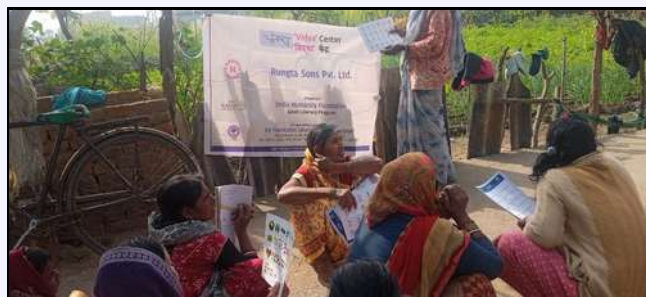
Adult learners at a literacy centre

Across centres, similar progress is unfolding. Learners are beginning to identify letters and numbers, write their names and addresses, and perform simple arithmetic—milestones that build confidence and independence. As the program moves toward completion this month, it reinforces a simple truth: literacy is not just about learning to read and write—it is about opening doors to dignity, self-reliance, and new beginnings.