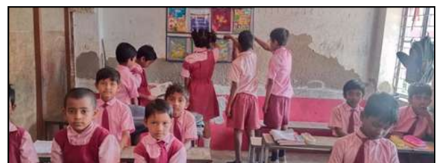
Classroom library setup in a school